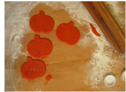
Javiera making cookies!

Water (38%), Organic ww bread flour (30%), Organic 14% white bread flour (16%), Organic white bread flour (15%), Canola oil, salt.