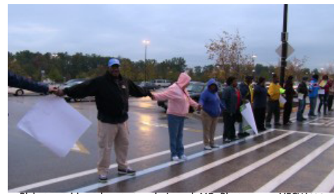
Picket outside walmart store in Laurel, MD.

During the recent teacher's strike in Illinois there were actions where teachers came to picket with warehouse workers on strike. But the most notable thing to happen are recent strikes by employees of Walmart at various store locations across the county. It is the first time in the 50 year history of Walmart for workers to walk off their jobs.