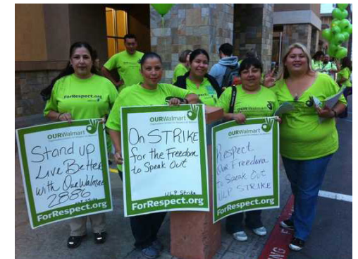
Members of OUR Walmart in California.

Sources: articles on www.alternet.org , www.salon.com , and In These Times . For more info, see www.forrespect.org – the website of Walmart workers' membership association OUR Walmart.