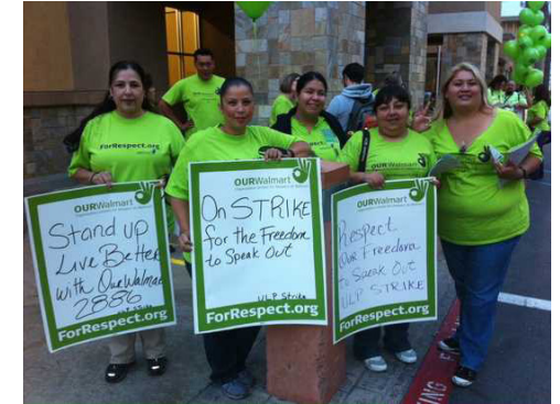
Members of OUR Walmart in California.

Sources: articles on www.alternet.org , www.salon.com , and In These Times . For more info, see www.forrespect.org – the website of Walmart workers' membership association OUR Walmart.