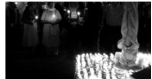
Vigil Wednesday night at the Sikh GuruDwara of NC in Durham to remember the victims of the senseless violence at Oak Creek temple, Wisconsin.

Sikhism was originated in northern part of India called Punjab; it was initiated about 500 years ago. The majority of the 25 million Sikhs live in northern India. There are approximately 700,000 Sikhs in the USA. They are the followers of Sikh Scriptures contained in Holy "Guru Granth Sahib". Often, Sikhs have been mistakenly identified with Osama Bin Laden and been victim of hatred and ridicule. For more information on Sikhism, visit: http://www.saldef.org/learn-about-sikhs/