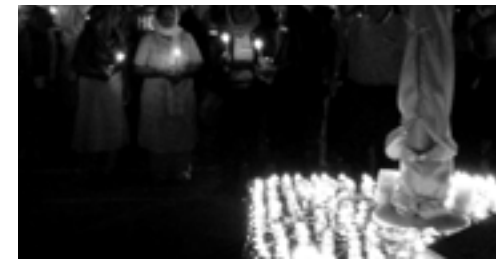
Vigil Wednesday night at the Sikh GuruDwara of NC in Durham to remember the victims of the senseless violence at Oak Creek temple, Wisconsin.

PS. We definitely have room for new members this season. If you know people in food insecure households, or people of color, who would want to join the bakery, please invite them! Contact us if you want subscription materials.